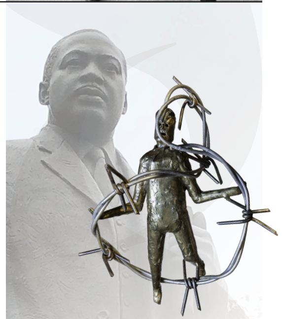
"CHURCH CONCERN FOR MAN CONFINED" ST. MARK'S REREDOS, FIGURE 140

Enjoy a late lunch at a local bbq spot before heading to the airport for departure. There is direct flight from Birmingham to LaGuardia Airport at 5pm.