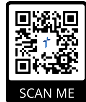
Episcopal Relief & Development