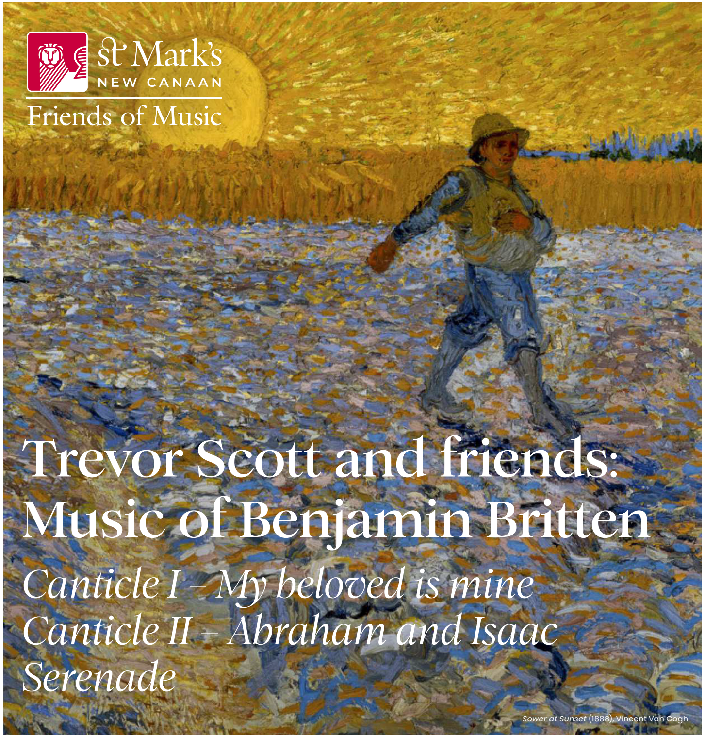
Sower at Sunset (1888), Vincent Van Gogh