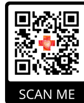
Episcopal Diocese of Los Angeles

The Episcopal Diocese of Los Angeles and Episcopal Relief & Development.